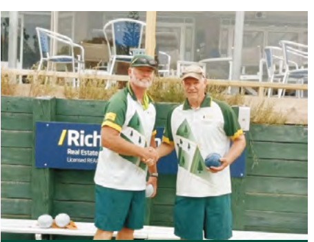
2022/23 Junior Singles Champion