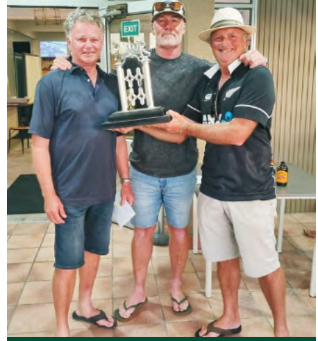
KPA Twilight Bowls Winners