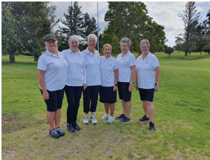
Our Beaches team

On the 13 th October we hosted the Beaches tournament welcoming Tairua, Williamson and Titoki clubs. This event was unable to be played in February and it was great that we were able to host it in stunning weather. Tairua took the cup away with a healthy lead.