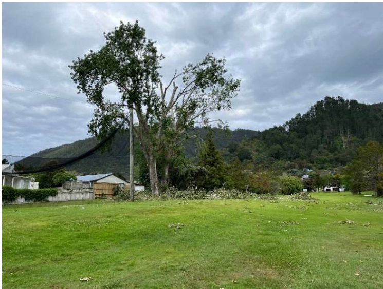
Tree pruning at Lakes #5

On 2/11/23, Matt Groube managed to get the arborists to prune the two Poplars trees on Lakes 5. Clean up is scheduled take place on 6/11/23 (Done!).