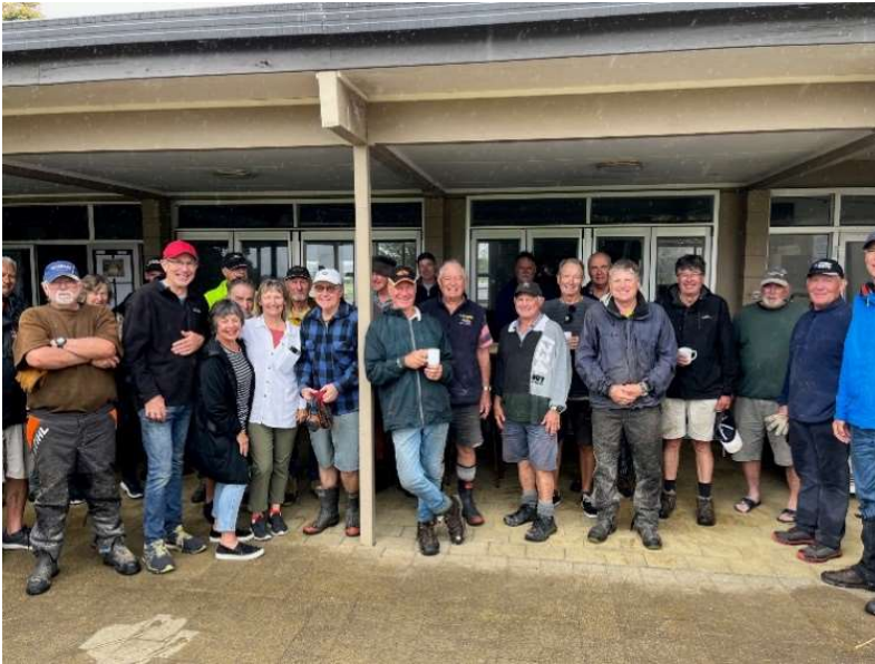
The volunteer team