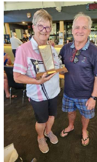
Peel Walker Trophy Winners