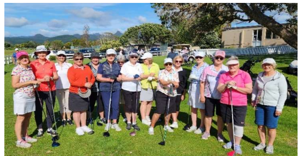
Mens and Womens Shootout players