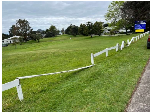
Broken fence at Lakes no 7 hole

The annual audit of the irrigation systems to check the operation, throw, arc and level of all the sprinklers has been completed on the Pines course but not yet on the Lakes. The audit has revealed that several sprinklers need adjusting typically for arc but we also discovered another leak on the 4 th fairway which is yet to be fixed. We will complete the audit on the Lakes course in the next few weeks.