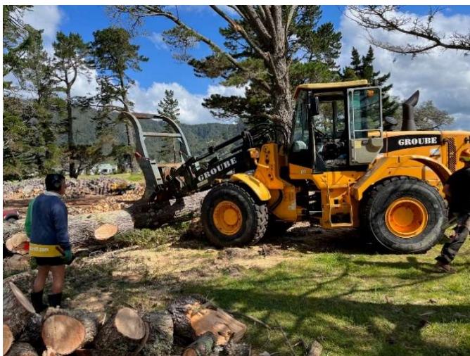
Trunk sections being moved