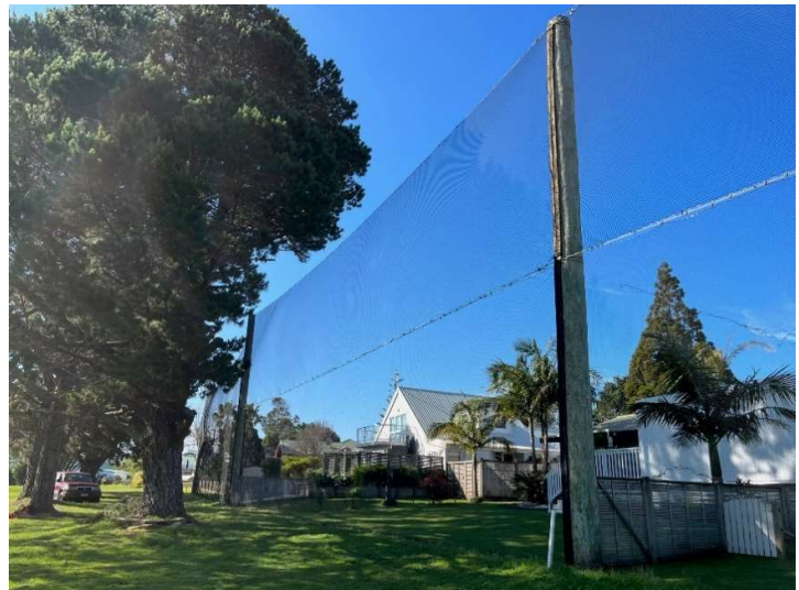
The finished job at Lakes #3

We will require a big working bee from 24/10-27/10 to assist with green renovation and clearing 3 dropped pines. More details nearer the time. Please come and help.