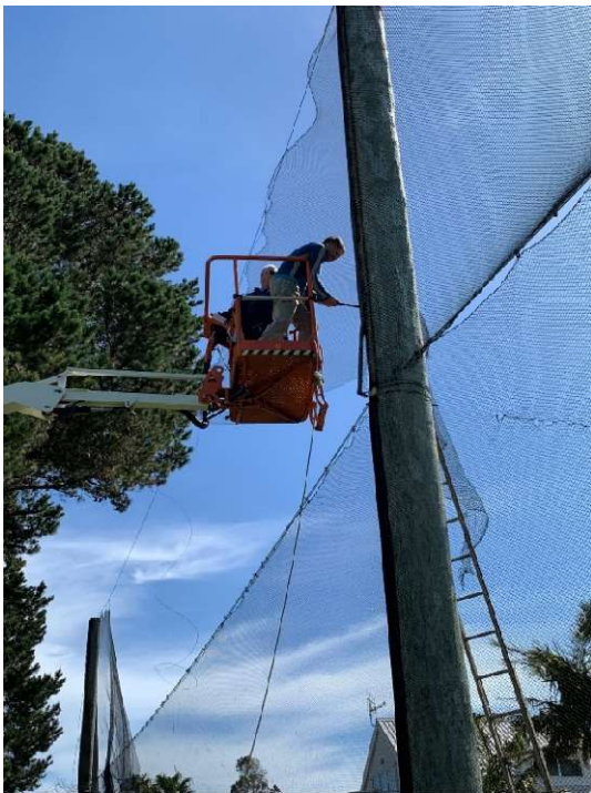
Working on the net