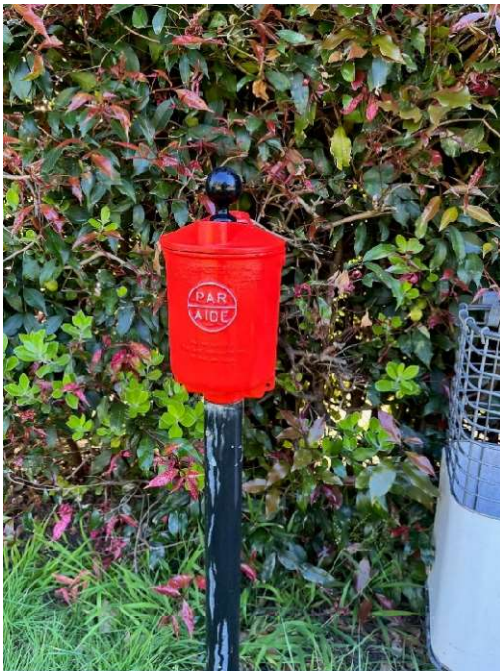
Ball washer Pine #7

The Club Manager has given the go ahead to drop 3 trees on the Pines course, one on the 1 st fairway close to the green and two on the 4 th fairway about 90m from the green. All of these trees have had hanging branches and are considered the most dangerous. The work will be scheduled for the week beginning 24 October whilst renovation is being done and the course closed. Volunteers will be required to do the major clean up.