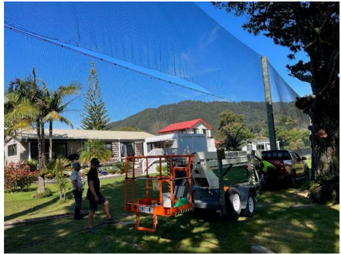
Setting up the cherry picker

We hired a cherry picker from Thames last week and have replaced the top middle section of protection netting on Lakes #3 fairway and some other small jobs were also completed. Thanks to Brian James who did the 4 hour round trip to Thames twice this week to pick up and return the machine.